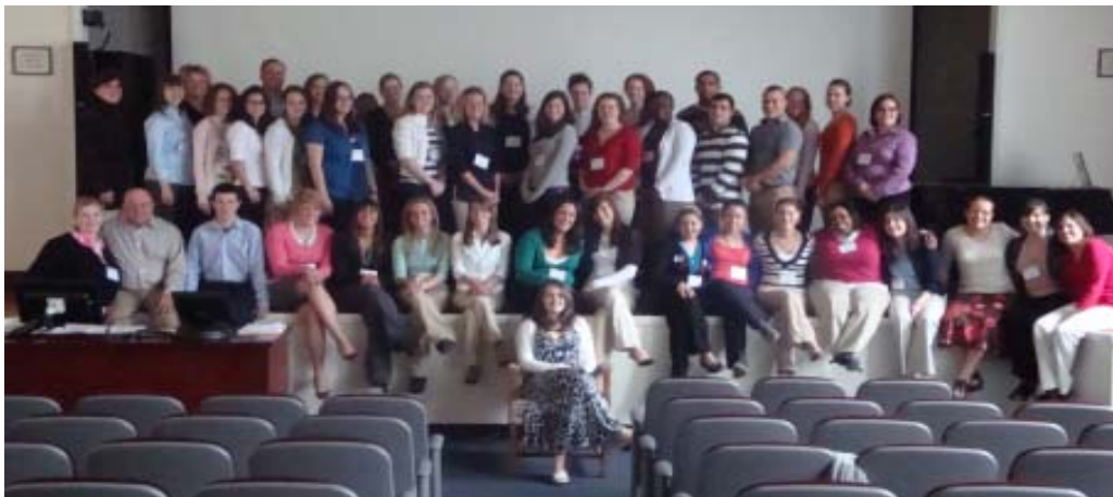
2009 SNAP LEAD Participants & Speakers