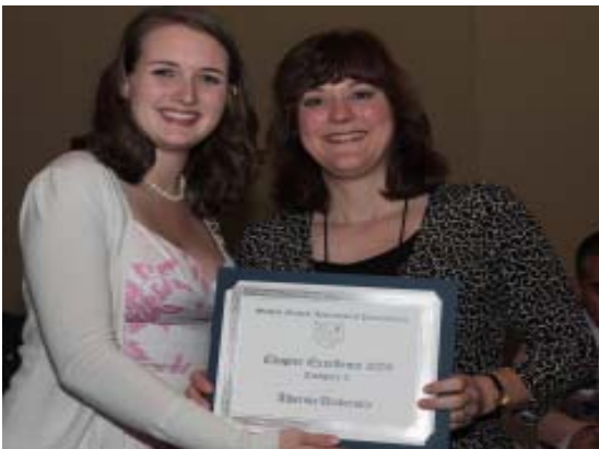
Alvernia University received the Chapter Excellence Award for Category 2