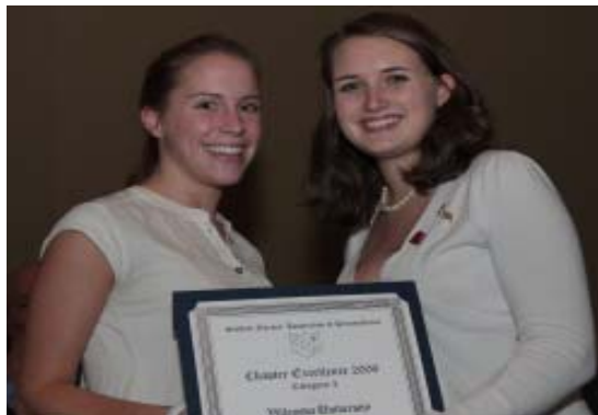
Villanova University received the Chapter Excellence Award for Category 3